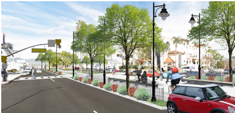
The proposal includes new safe crossings with pedestrian hybrid beacons at: San Jose St, Lemarsh St (shown above), Superior St, and between Nordhoff and Superior; and new traffic signals at Bermuda St and Mayall St.